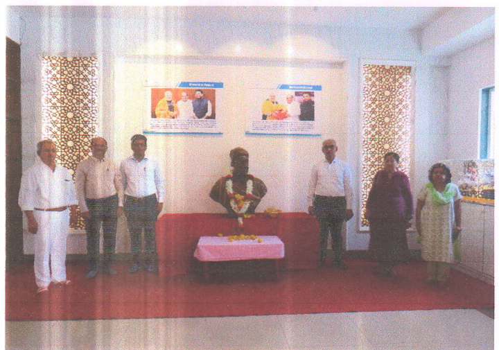
Teacher's Day Celebration 2023-24